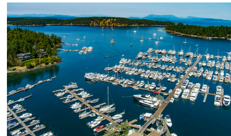
ROCHE HARBOR CONDOMINIUM $699,000 - LISTING ID 2132058