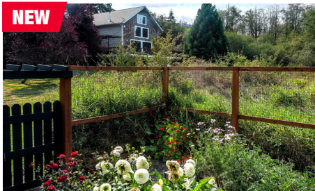
NEW HOME ON ACREAGE WITH LAKE ACCESS $1,030,000 - LISTING ID 2291228