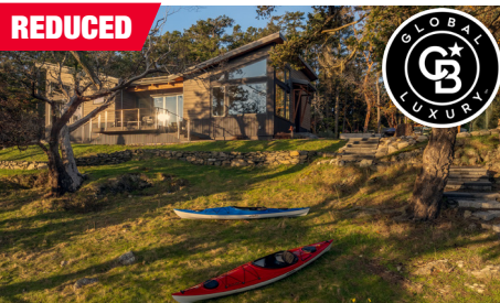
REDUCED WATERFRONT HOME WITH DOCK AT THE CAPE $2,650,000 - LISTING ID 2207273

https://www.sanjuanislandslifestyle.com/blog