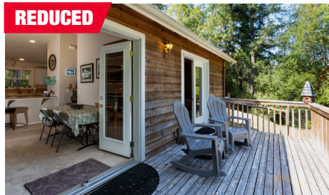
REDUCED CHARMING HOME NEAR TOWN $649,000 - LISTING ID 2279299