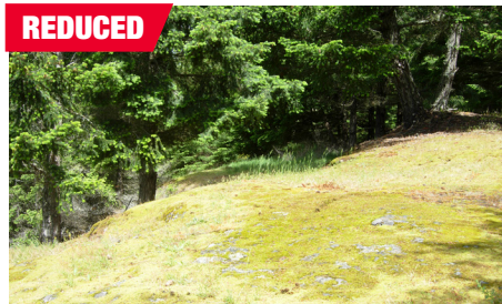
REDUCED DISTANT WATER VIEW ACREAGE $399,000 - LISTING ID 2260103