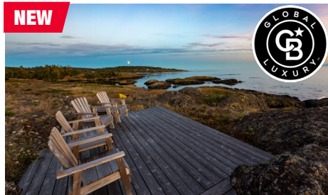
NEW WEST SIDE WATERFRONT HOME $2,350,000 - LISTING ID 2291467