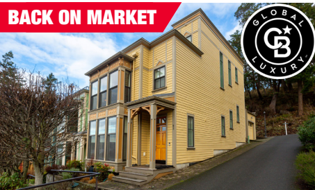
BACK ON MARKET ROCHE HARBOR WATER VIEW TOWNHOME $2,060,000 - LISTING ID 2222331