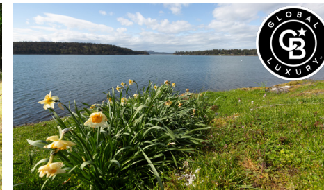
WATERFRONT CABIN ON ACREAGE $3,800,000 - LISTING ID 2255443